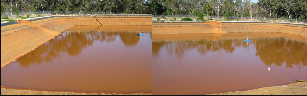
Concentration pond for Iron settlement. Note, Iron build-up on top of the sump in far-right image below. This indicates iron dropping out the water column from added aeration.